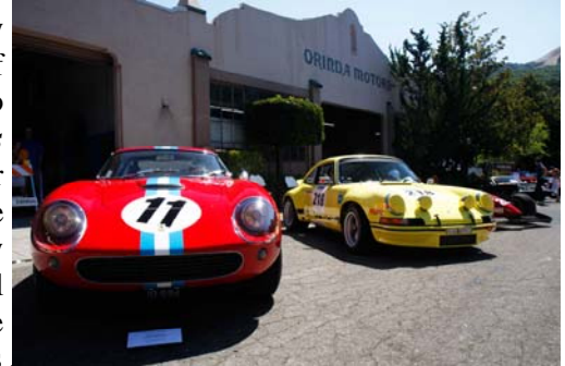
Porsches on display in front of Orinda Motors