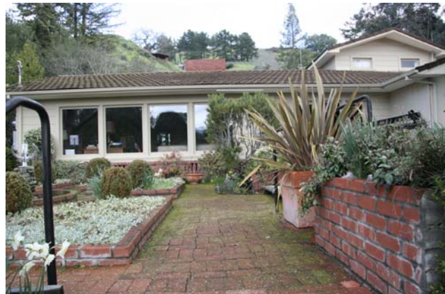
Paterson Home March 2009— The house is now hidden from the street by vegetation