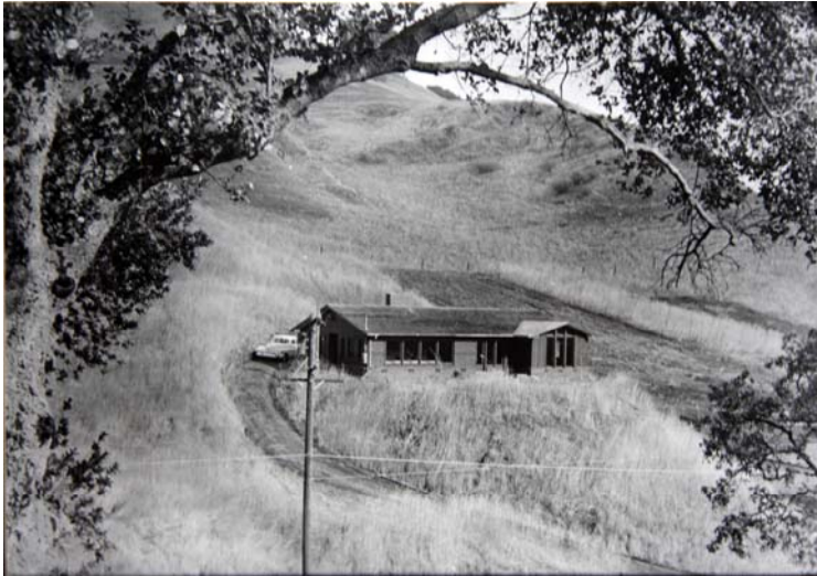
The Paterson House under construction circa 1950