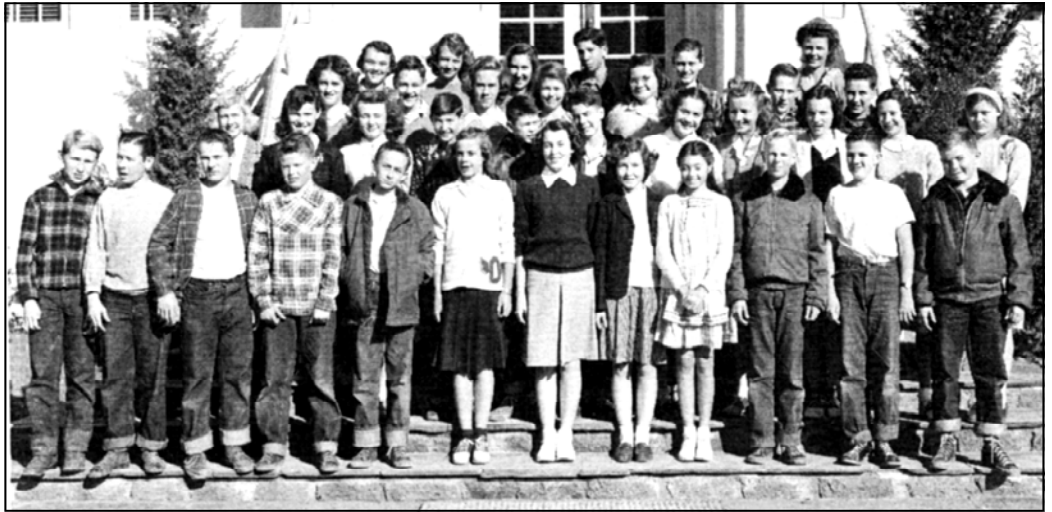
Orinda Union School 8th Grade Class in 1947