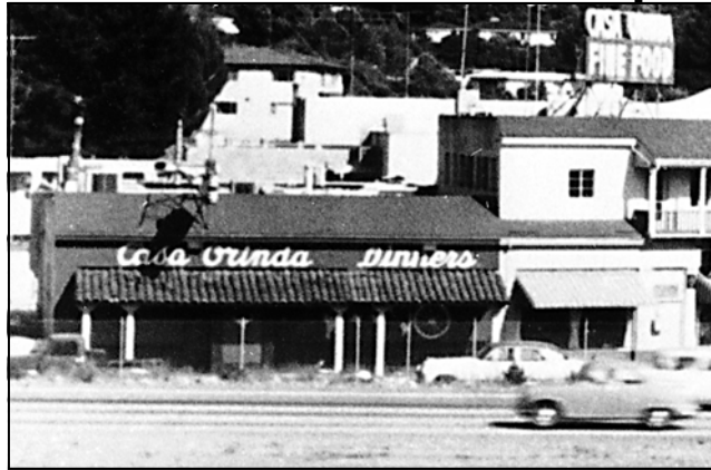
Casa Orinda Restaurant Circa 1960